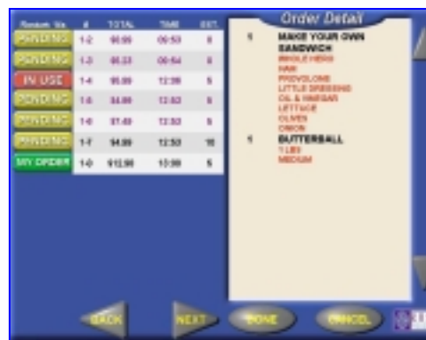
RMS Order Management Display

RMS-Kiosk has a low deployment cost and a very high ROI.