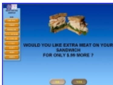
RMS-Kiosk promotes brands and items